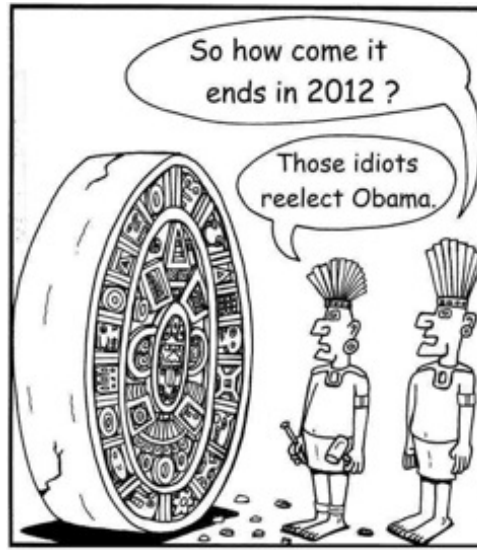
At last, the mystery of the Mayan calendar revealed.

Note: The Tortoise is the symbol of Fabian Society, representing its goal of gradual expansion of socialism. The Fabian Socialists successfully worked a 150 year plan, and have conquered the Christian world while Christians have waited for a “rapture” to get them out of the mess they allowed to develop.