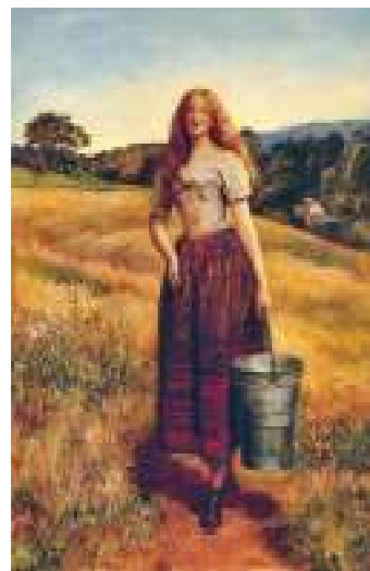
But if a woman have long hair is it her glory I Cor. 11:15

As the schools continue to fail, parents are beginning to realize the dangers of sending their kids to public school. Homeschool parents are realizing that they can do a better job in educating their kids—and they are doing just that. Homeschooling is an option that is available to parents if they are seriously committed to educating and teaching their children in traditional, biblical values America was founded on. If kids are not taken out of the failing public school system, America is likely to loose a generation of children.